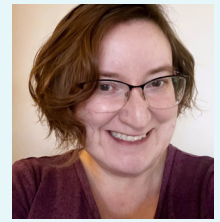
Rijelle Kraft Center for Schools and Communities