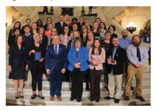
Blue Ribbon Award winners, including a group of ChildLine workers, in the Capitol Rotunda

In addition, the independent panel of award judges honored the state's County Children and Youth caseworker staff and ChildLine staff for their diligent efforts to protect children.